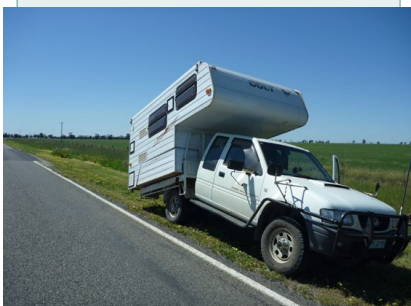
The end of the road....

A costly lesson to learn. We will need to acquire a tougher truck if we wish to continue our travels with this rig.